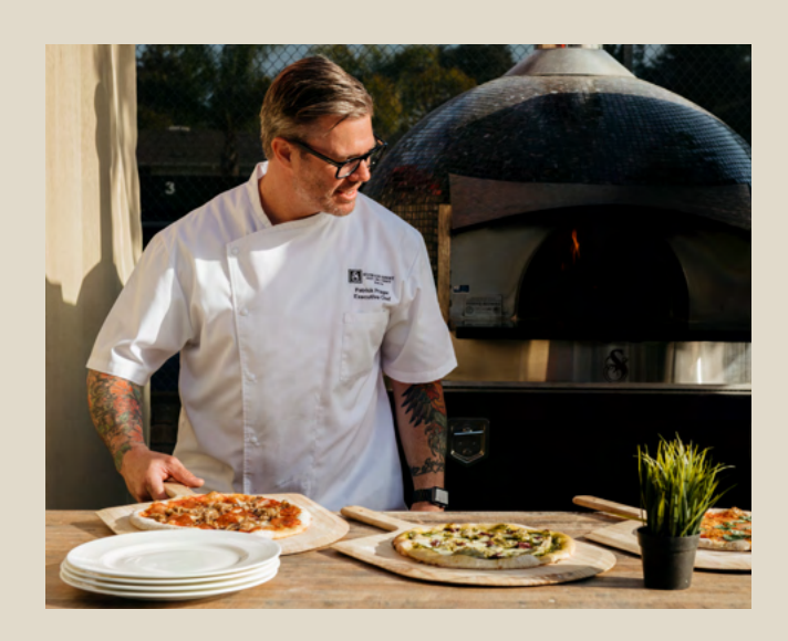
Forno Pizza at Silverado Market & Bakery serves up enticing pizzas from the outdoor wood-fired grill to be enjoyed on the terrace or in your room.