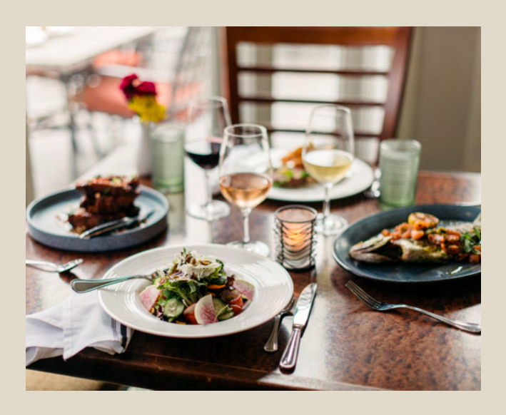
The Grill features Napa's finest farm-fresh ingredients, offering verdant golf course views with indoor and outdoor seating. Open daily for breakfast, lunch, and dinner, as well as brunch.

Offering a diverse mix of dining venues, Silverado is a celebration of culinary craft and culture. With organic ingredients straight from our on-site garden or sourced from Napa Valley producers, wineries, and farmers, every season brings a new lineup of hyperlocal, plant-forward dishes—showcasing the region's most celebrated and emerging talents to sate your appetite for delicious discovery.