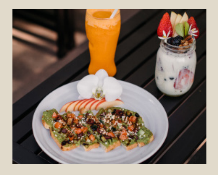
Boost Café is a healthy spot, located in the spa, to unwind post workout with salads, sandwiches, fruit juices, and smoothies.