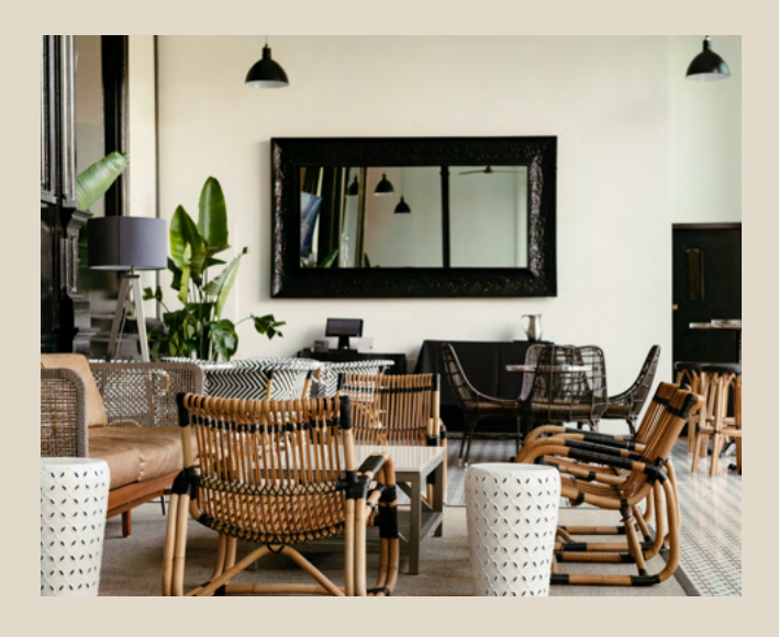
Mansion Bar & Terrace, located off the lobby, is the ideal place to gather and enjoy small bites, signature cocktails, craft beer, and wine around the fire on the outdoor terrace or at the sunken bar top.